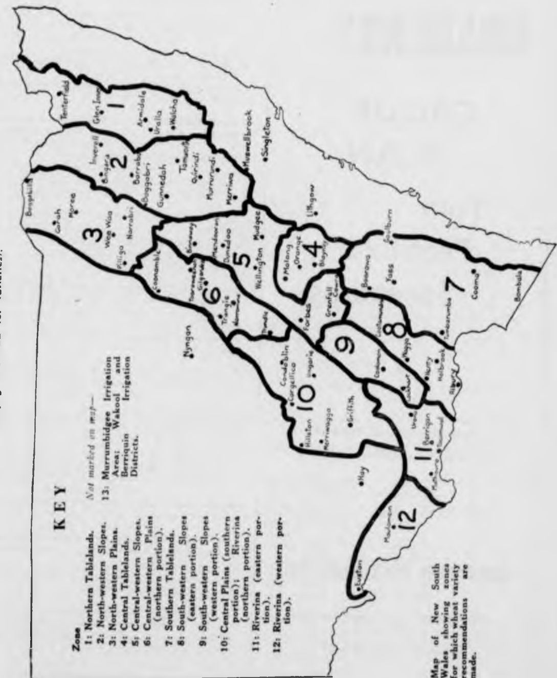
MAP SHOWING ZONES FOR WHICH WHEAT VARIETIES ARE RECOMMENDED. (See page 10-22 for varieties).

(Garah, Moree, Wee Waa, Narrabri, Pilliga). Early Sowing—Celebration. Mid-season Sowing—Warigo, Eureka. Late Sowing—Gabo, Festival, Spica, Koda (substitute for Gabo in flag-smut liable areas).