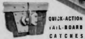
QUICK-ACTION TAIL-BOARD CATCHES