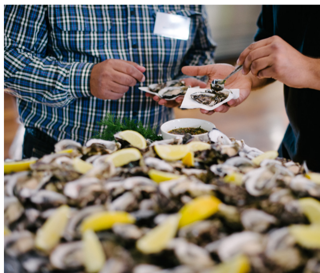
The Sydney Royal Talk & Taste setting (above left) and freshly shucked oysters at Talk & Taste