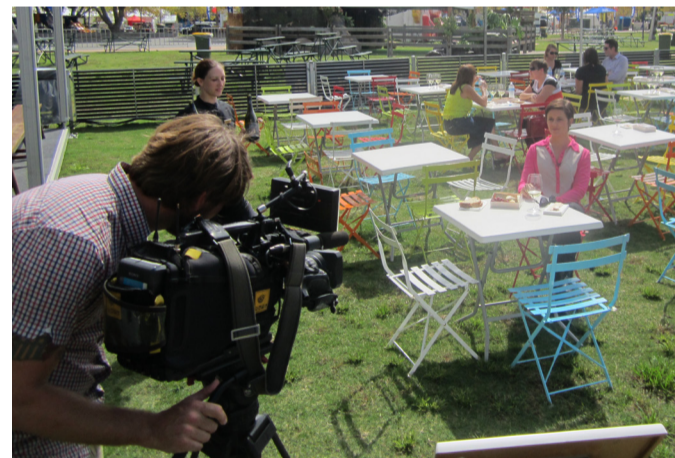
Media filming at the Sydney Royal Beer and Wine Garden

The media preview finished at the all-new Sydney Royal Talk & Taste experience at The Daily Telegraph Park. The media was treated to some freshly shucked rock oysters and a glass of award-winning wine to showcase a selection of gourmet produce that will be on offer at this year's Show.