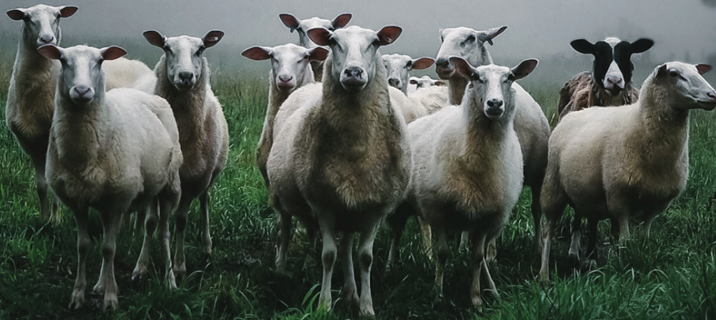
Pecora Dairy, Robertson NSW – Winner 17th Annual President's Medal

18TH ANNUAL RAS OF NSW PRESIDENT'S MEDAL