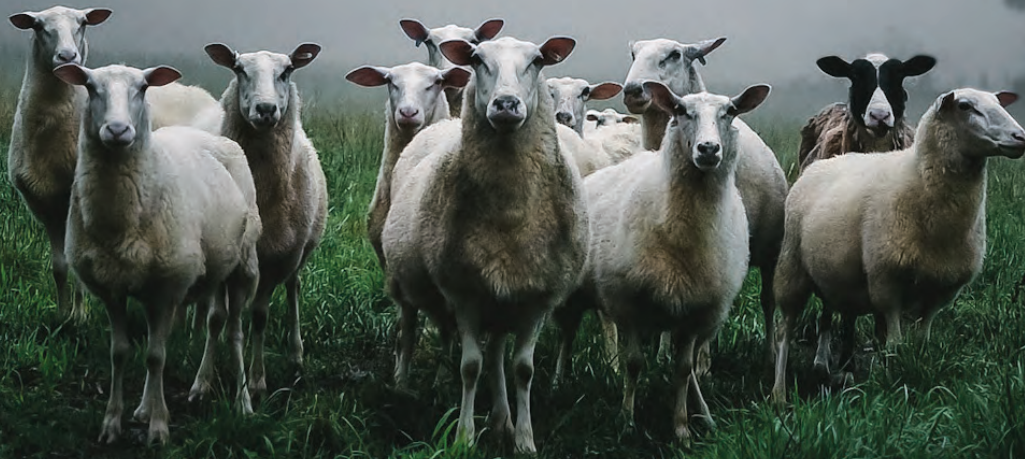
Pecora Dairy, Robertson NSW – Winner 17th Annual President's Medal

18TH ANNUAL RAS OF NSW PRESIDENT'S MEDAL