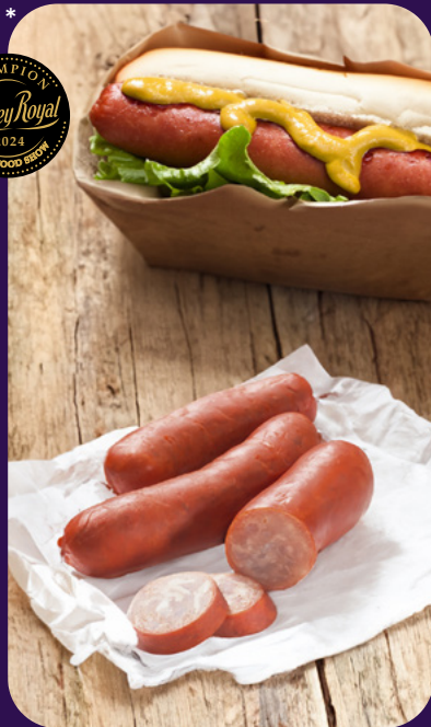
Champion Other Charcuterie Product