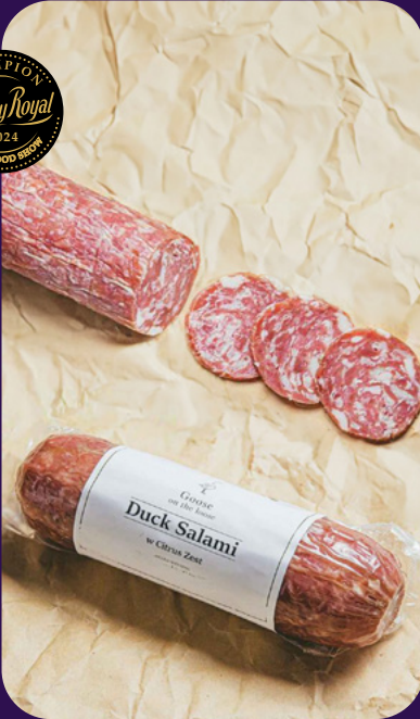
Champion Salami Type Product

GOOSE ON THE LOOSE MONTECATINI SPECIALTY SMALLGOODS PTY LTD