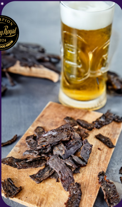
Champion Jerky or Biltong Type Product

BELLBROOK SALAMI AND CHARCUTERIE BELLBROOK SALAMI AND CHARCUTERIE