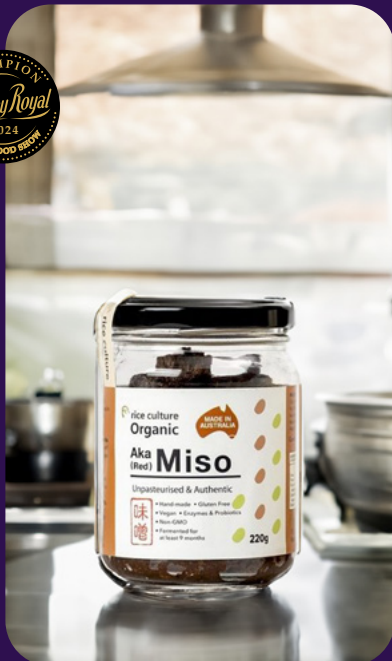
Champion Pickled or Fermented

RICE CULTURE EDOMURA AUSTRALIA PTY LTD. TRADING AS RICE CULTURE