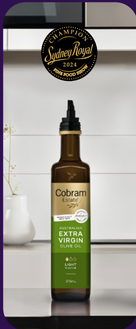
Champion Blended Extra Virgin Olive Oil

COBRAM ESTATE OLIVES COBRAM ESTATE OLIVES