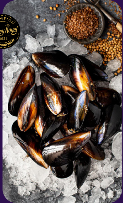
Champion Other Aquaculture Product