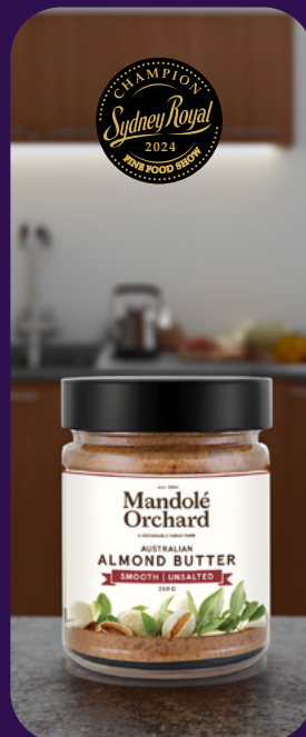
Champion Plant Based Product