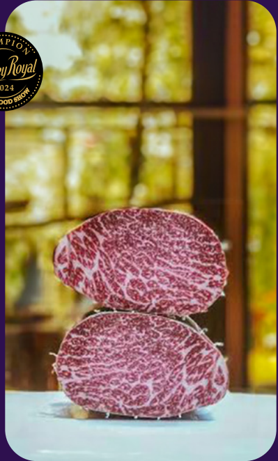
Champion Dried or Cured Product