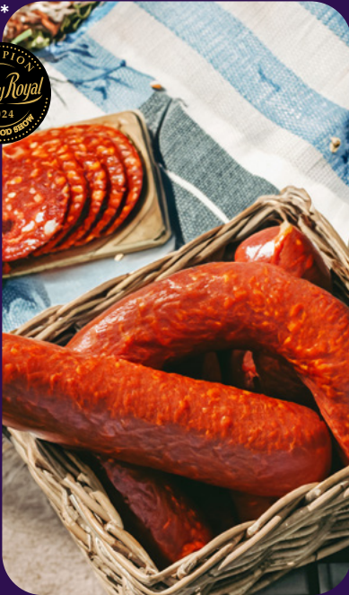
Champion Chorizo Product