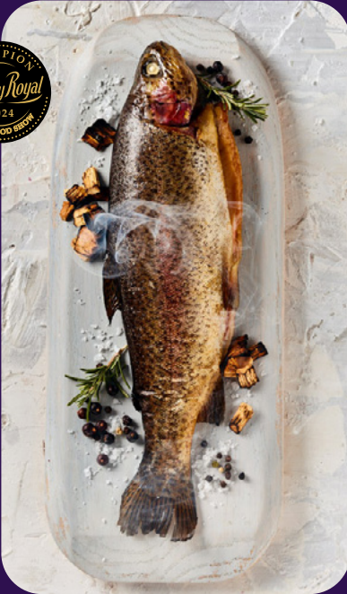
Champion Smoked or Cured Aquaculture