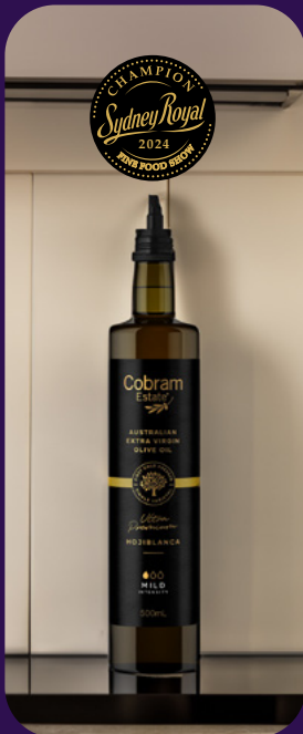
Champion Single Varietal Extra Virgin Olive Oil

COBRAM ESTATE OLIVES COBRAM ESTATE OLIVES