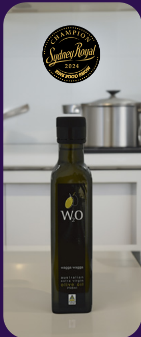
Champion Boutique Extra Virgin Olive Oil