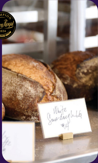
Best Professional Bakery Apprentice/ Student Exhibit