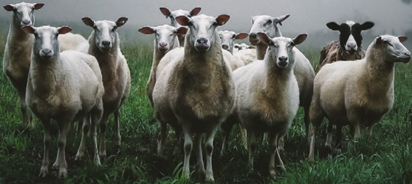
Pecora Dairy, Robertson NSW – Winner 17th Annual President's Medal