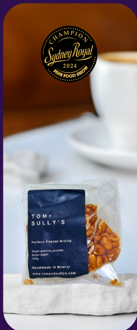
Champion Chocolate or Confectionery