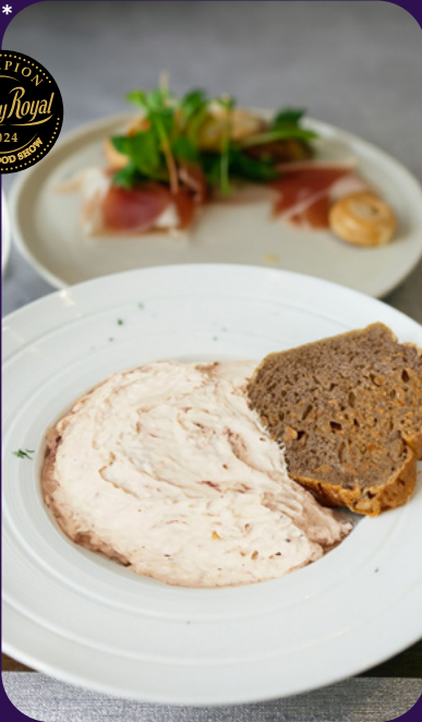
Champion Other Specialty Foods