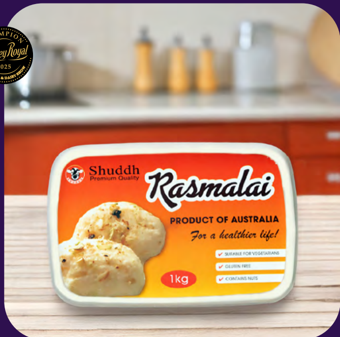
Champion Dairy Dessert, Custard or Mousse