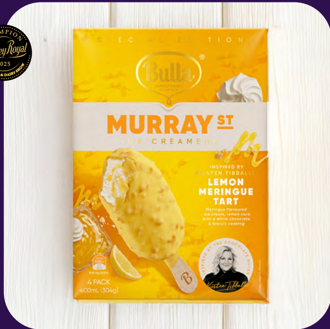
Champion Novel Ice Cream or Gelato

Bulla Family Dairy MURRAY ST LEMON MERINGUE TART STICKS DERRIMUT, VIC