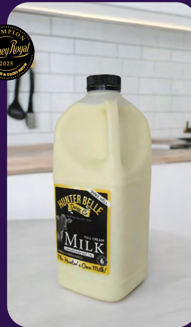
The Jim Forsyth Perpetual Trophy for Champion White Milk