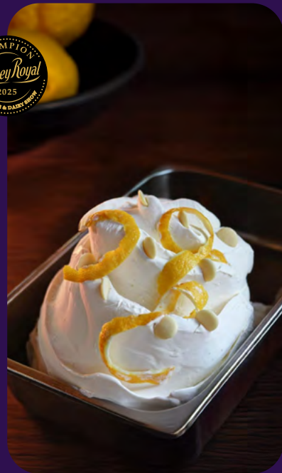
Champion Low/Reduced Fat Ice Cream or Gelato

Cow and the Moon WHITE CHOCOLATE YUZU ENMORE, NSW