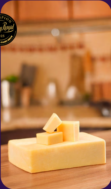
The NSW Food Authority Perpetual Trophy for Champion Cheddar Cheese

Bega Cheese BEGA RINDLESS VINTAGE BEGA, NSW