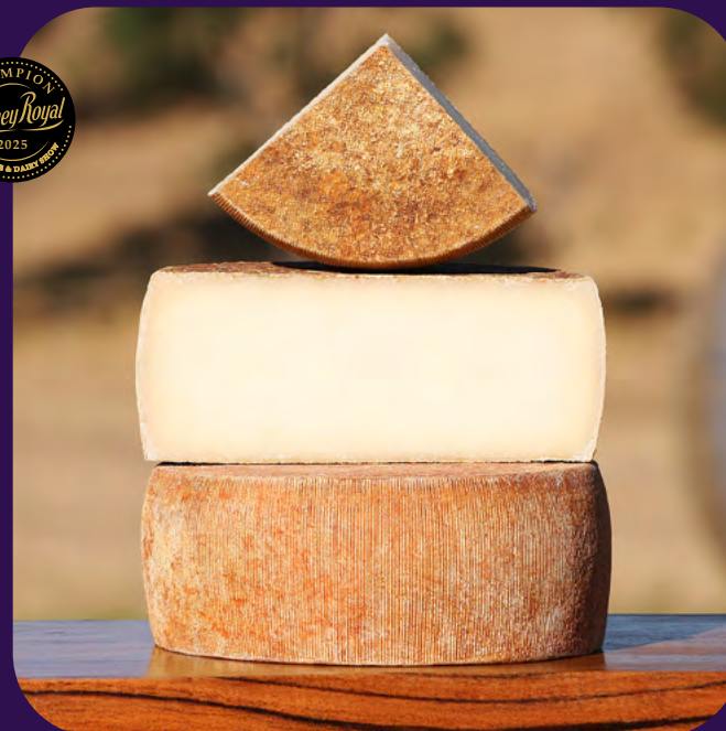
The Bega Cheese Perpetual Trophy for