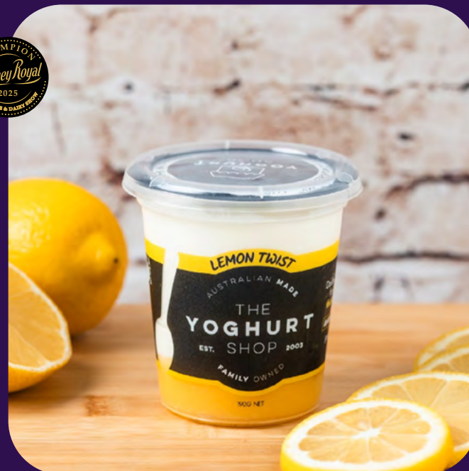
The Bega Cheese Perpetual Trophy for Champion Yoghurt or Cultured Milk Product

The Yoghurt Shop LEMON TWIST ADELAIDE, SA