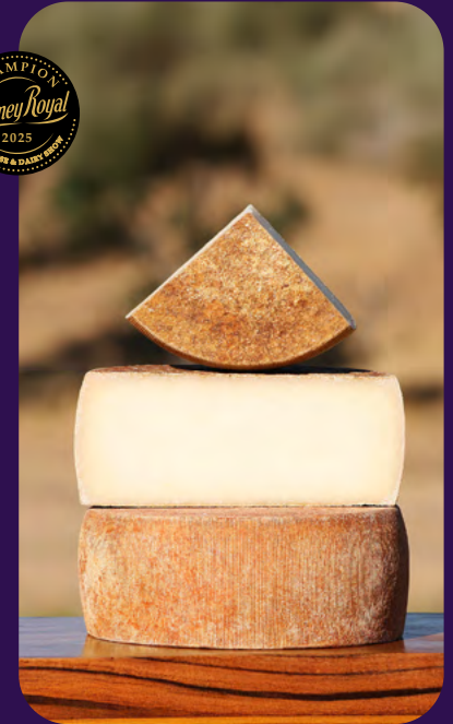
Champion Cheese of Show

Little Yarra Cheese Company Pty Ltd LILYARRA ARAN SEMIHARD GOAT CHEESE VICTOR HARBOR, SA