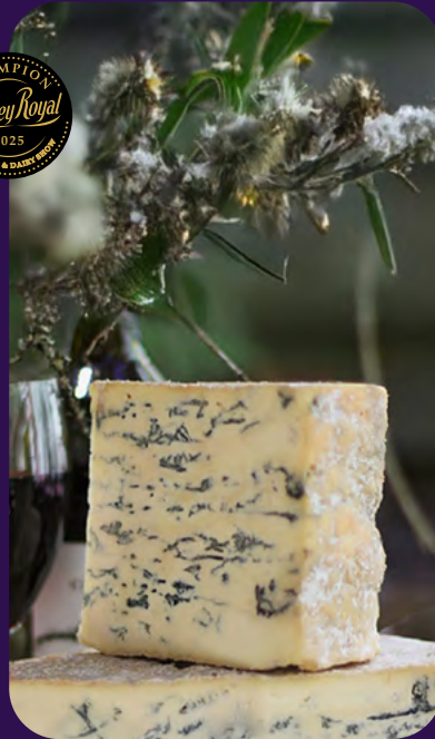
The NSW Food Authority Perpetual Trophy for Champion Specialty Cheese

Berrys Creek Gourmet Cheese OAK BLUE FISH CREEK, VIC