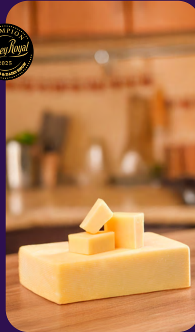
The Dairy Australia Perpetual Trophy for Champion Cow Milk Cheese

Bega Cheese BEGA RINDLESS VINTAGE BEGA, NSW