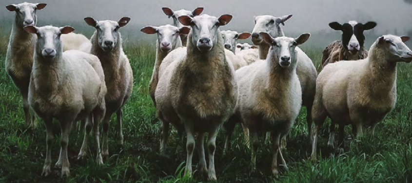
Pecora Dairy, Robertson NSW – Winner 17th Annual President's Medal