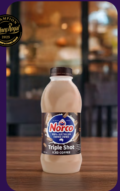
Champion Flavoured Milk