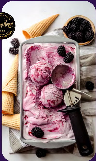
Champion Full Cream Ice Cream or Gelato

Gelato Bliss WILD BLACKBERRY CHATSWOOD, NSW