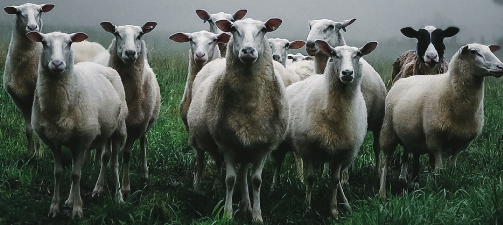
Pecora Dairy, Robertson NSW – Winner 17th Annual President's Medal

18TH ANNUAL RAS OF NSW PRESIDENT'S MEDAL